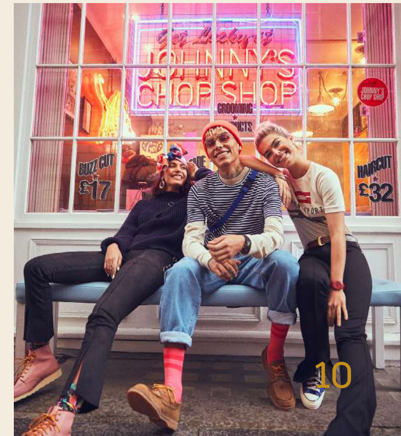
Johnny's Chop Shop

Famous retail brands and independents within 5 minutes walk